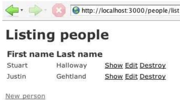
Figure 1.1: The Rails scaffold

Now, let's run the automated tests for your application: